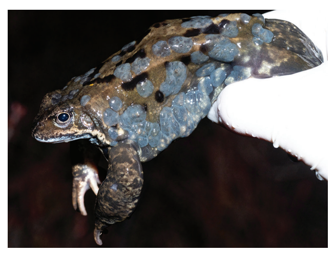
Figure 1. Ranid herpesvirus 3 infection in common frog Rana temporaria tadpoles, Norway. Image shows a large number of multifocal to coalescent, mildly elevated, gray patches (epidermal hyperplasia) extending over most of the integument, particularly clustering along the left flank. Between gray areas is normally pigmented skin.

Finding genomic RaHV3 DNA in free-ranging tadpoles is a major step toward understanding the