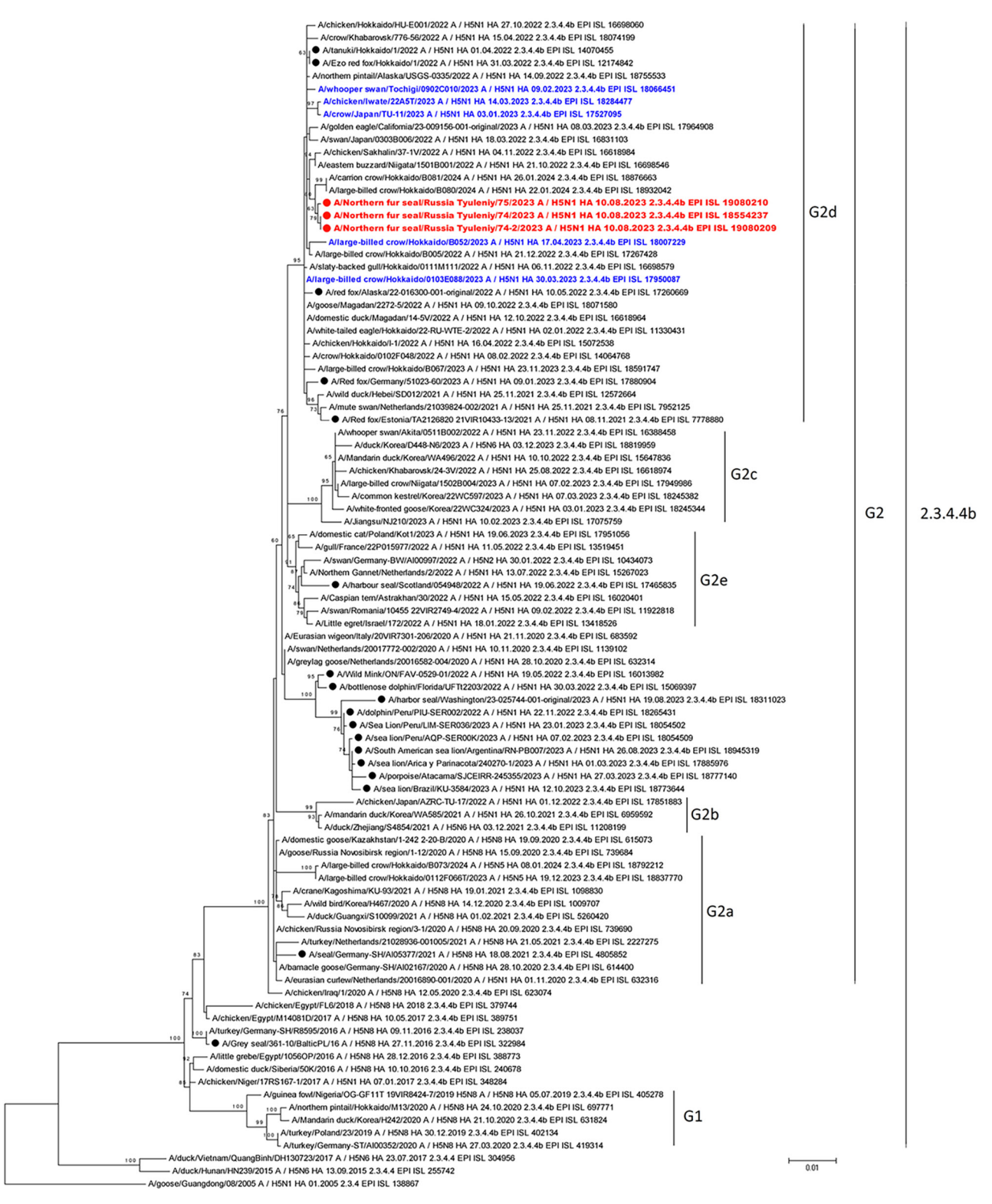
Figure 2. Maximum-likelihood phylogenetic tree of the hemagglutinin segment of HPAI A(H5N1) from northern fur seals on Tyuleniy Island in eastern Russia (red) and in other marine mammals, by clade group. Black dots indicate HA of viruses isolated from other mammals, and blue text indicates HPAI viruses isolated in Japan during January–April 2023. GISAID accession numbers are shown for reference sequences (https://www.gisaid.org). Note that dates are shown in DD.MM.YYYY format. Scale bar indicates number of substitutions per site. HA, hemagglutinin; HPAI, highly pathogenic avian influenza.