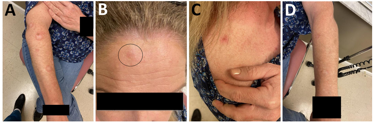
Figure 1. Leprosy lesions in a 55-year-old female patient in north Florida, USA. Multiple hypopigmented plaques with erythematous borders appeared along the right posterior forearm (A), right forehead (B), right trapezius (C), and left posterior forearm (D).

The patient manifested multiple macules and patches with central clearance and erythematous borders without hypoesthesias on the right arm and shoulder (Figures 1, 2). She denied having fever, chills, or abdominal pain but reported right knee pain and swelling, suggestive of arthritis, which is not uncommon in patients with leprosy. We prescribed monthly doses of 600 mg rifampin, 400 mg moxifloxacin, and 100 mg minocycline. We