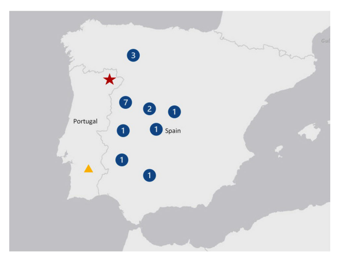
Figure 1. Regions of the Iberian Peninsula where human infections with Crimean-Congo hemorrhagic fever virus were reported. Red star indicates fatal case of Crimean-Congo hemorrhagic fever, Portugal, 2024; yellow triangle, the seropositive cases detected in the Beja district, Portugal, 1985. Blue numbered icons indicate the number of human cases reported in provinces in Spain since 2013 (Salamanca, 7; León, 3; Ávila, 2; Badajoz, 1; Cáceres, 1; Córdoba, 1; Madrid, 1; and Toledo, 1).

physical examination, his temperature was 38.5°C, heart rate 125 beats/min, respiratory rate 25 breaths/ min, and blood pressure 90/56 mm Hg; and he had a small periumbilical eschar and a petechial rash on his legs. Laboratory testing revealed thrombocytopenia, prolonged activated partial thromboplastin time,